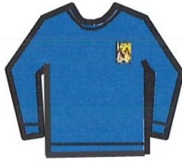
Royal Blue Sweatshirt